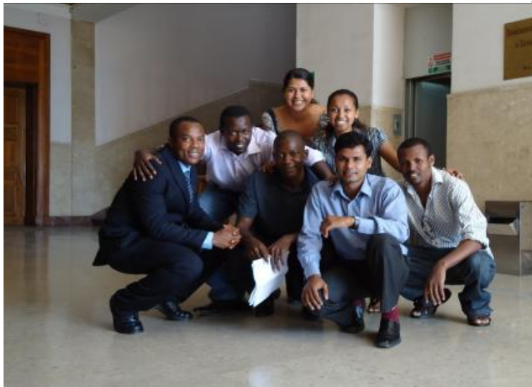
A group picture from Catania.