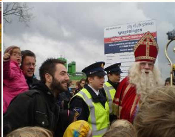
Sinterklaas celebration in Wageningen