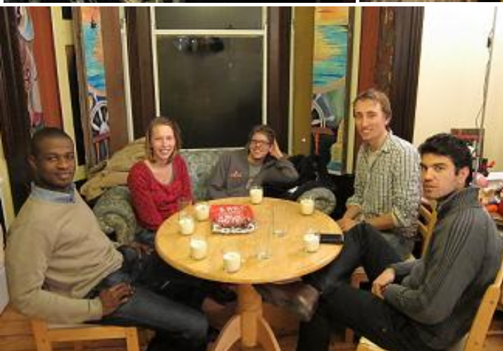
Sinterklaas dinner: Drinking Eggnog