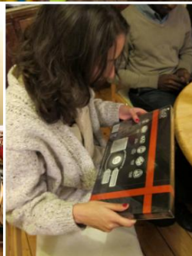
Sinterklaas dinner in Cork: Opening Presents