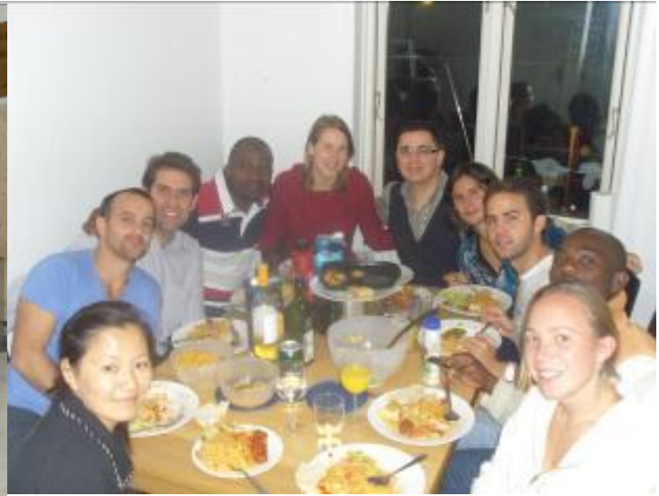
M1 and M2 students enjoying a group dinner in Copenhagen.