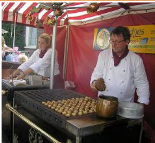
Sinterklaas Food Stand